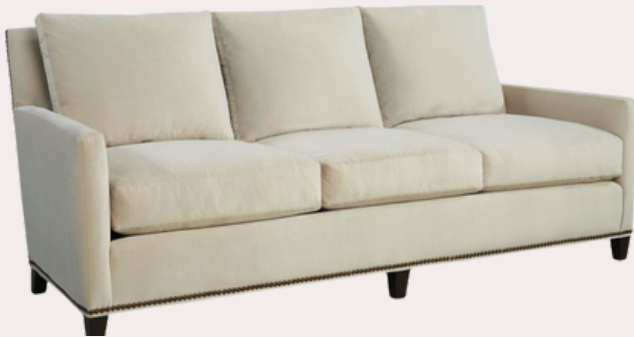
St. Paul Sofa

Starting at $3,680 | 2 sizes | upholstery | available as chair and ottoman