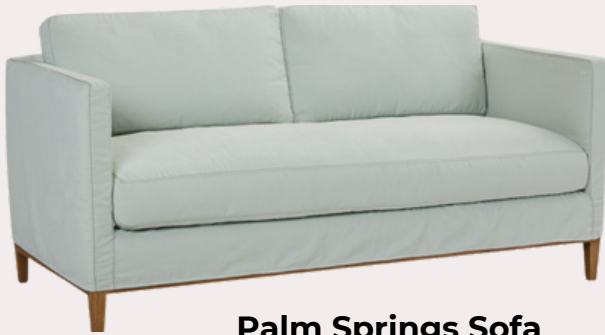
Palm Springs Sofa

The Stated Home offers a curated selection of sofas that can be customized to your preferences. Below, take a look at some of our bestsellers. If you don't see what you're looking for on our site, we can easily special order additional styles.